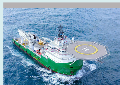
Marine - Offshore