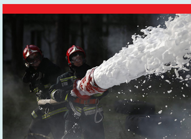
Fire Brigades-Fire Trucks