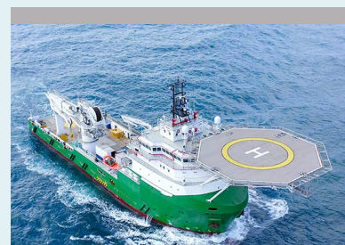
Marine - Offshore