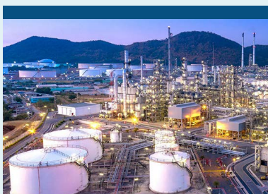
Industrial - Sprinkler

Economical and environmentally beneficial testing with optional Dosing/Return valve (DRV) and two separate flow meters.