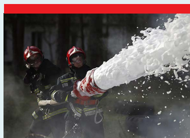
Fire brigades - Fire trucks